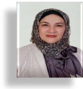
Vice Dean for Education and Student Affairs

In this context, the university has been keen to attract qualified international students, strengthen international relations in the field of education, and utilize all its resources to provide the best educational services and student care. This includes providing all information related to academic programs in the university's faculties, admission requirements, comprehensive student support, and resolving academic issues to activate and promote scientific collaboration, student exchange, and cultural dialogue among different nationalities. The university aims to be a beacon of science, arts, and literature. The Faculty offers eleven programs, including four programs for students with special needs, all taught under a credit-hour system by highly qualified and professional faculty members.